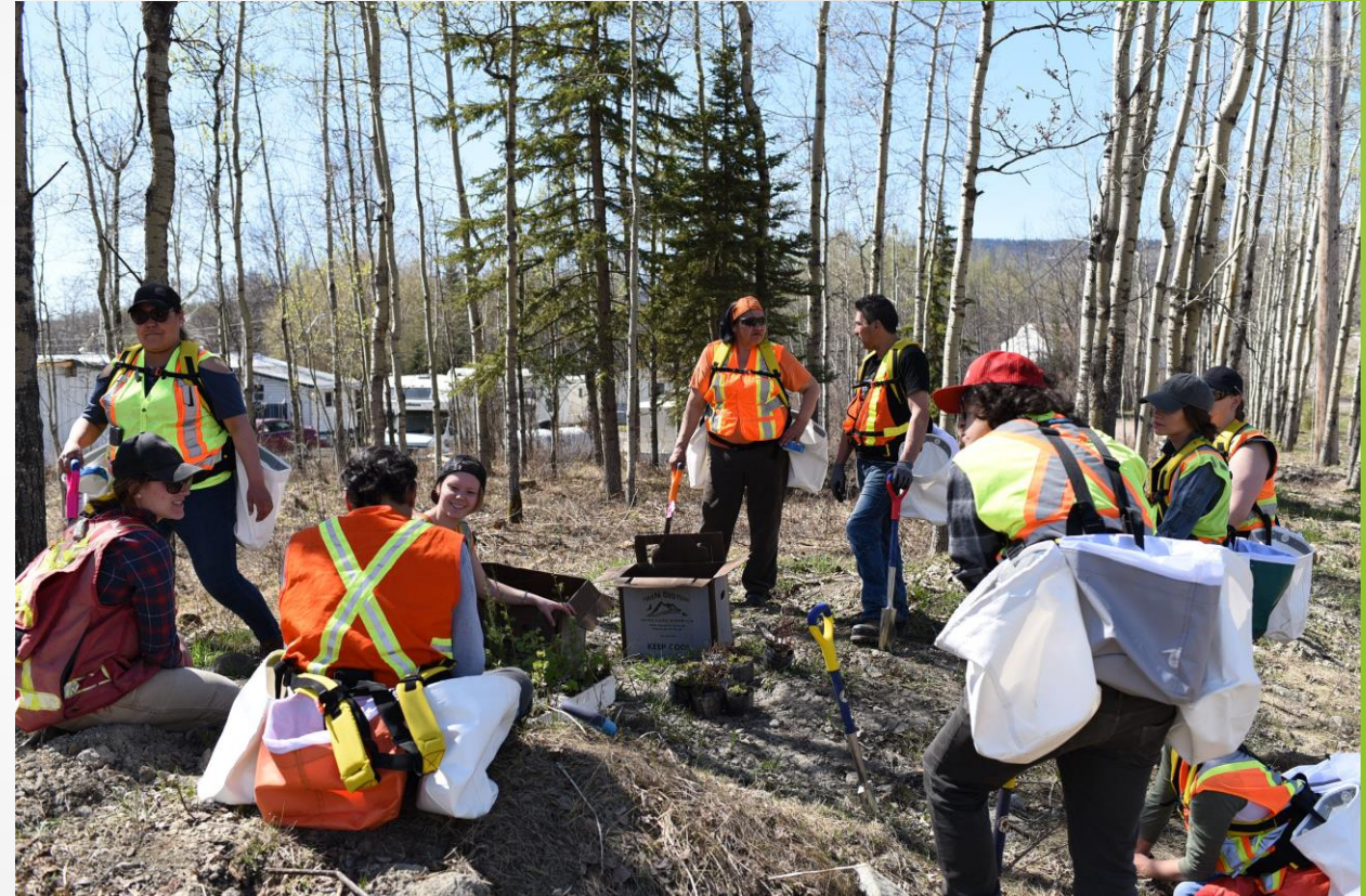
2019 Reclamation Training with Saulteau band members