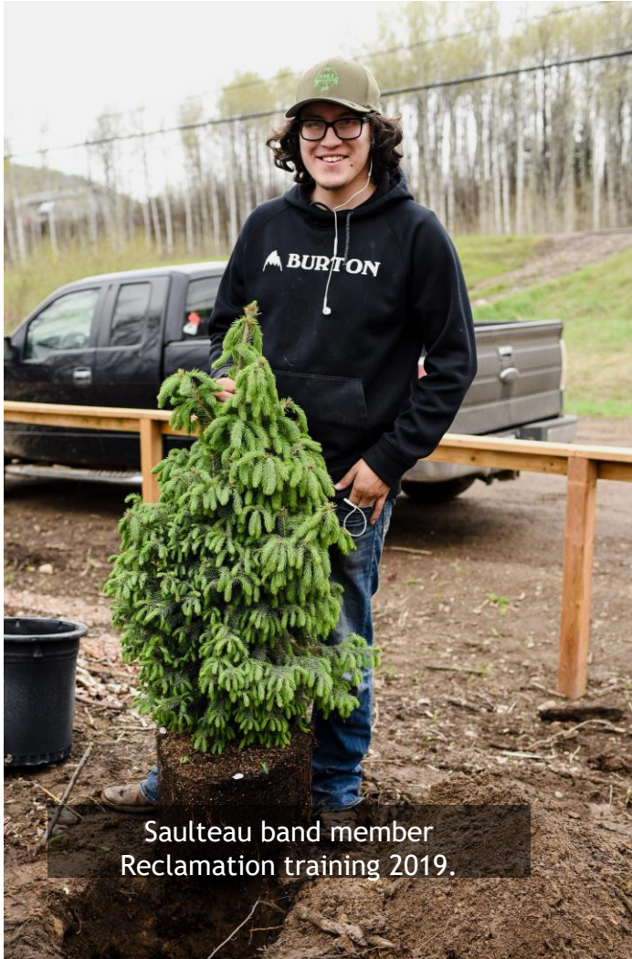
Saulteau band member Reclamation training 2019.